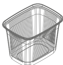
108 R container